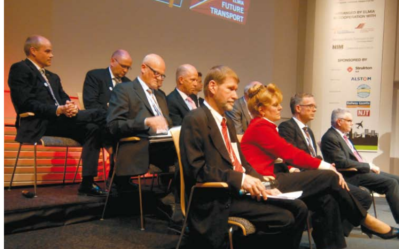
One of the fair days concentrates on the main conference, which focuses on a highly topical subject. It involves interesting speakers, politicians and business leaders.

Informal meetings are important too. During one evening of the show we organise a large buffet, which is enjoyed alongside good entertainment and pleasant company. The party event is very popular and quickly gets fully booked. We therefore give you, the exhibitors, priority ticket booking.