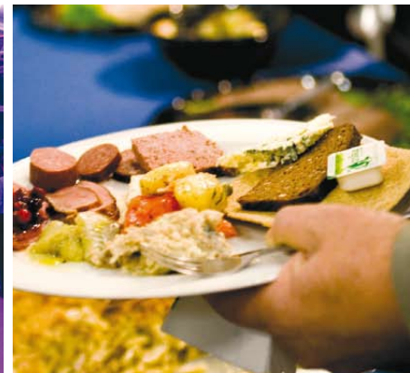
The big party on one of the evenings of the show is highly appreciated and attracts a lot of people.